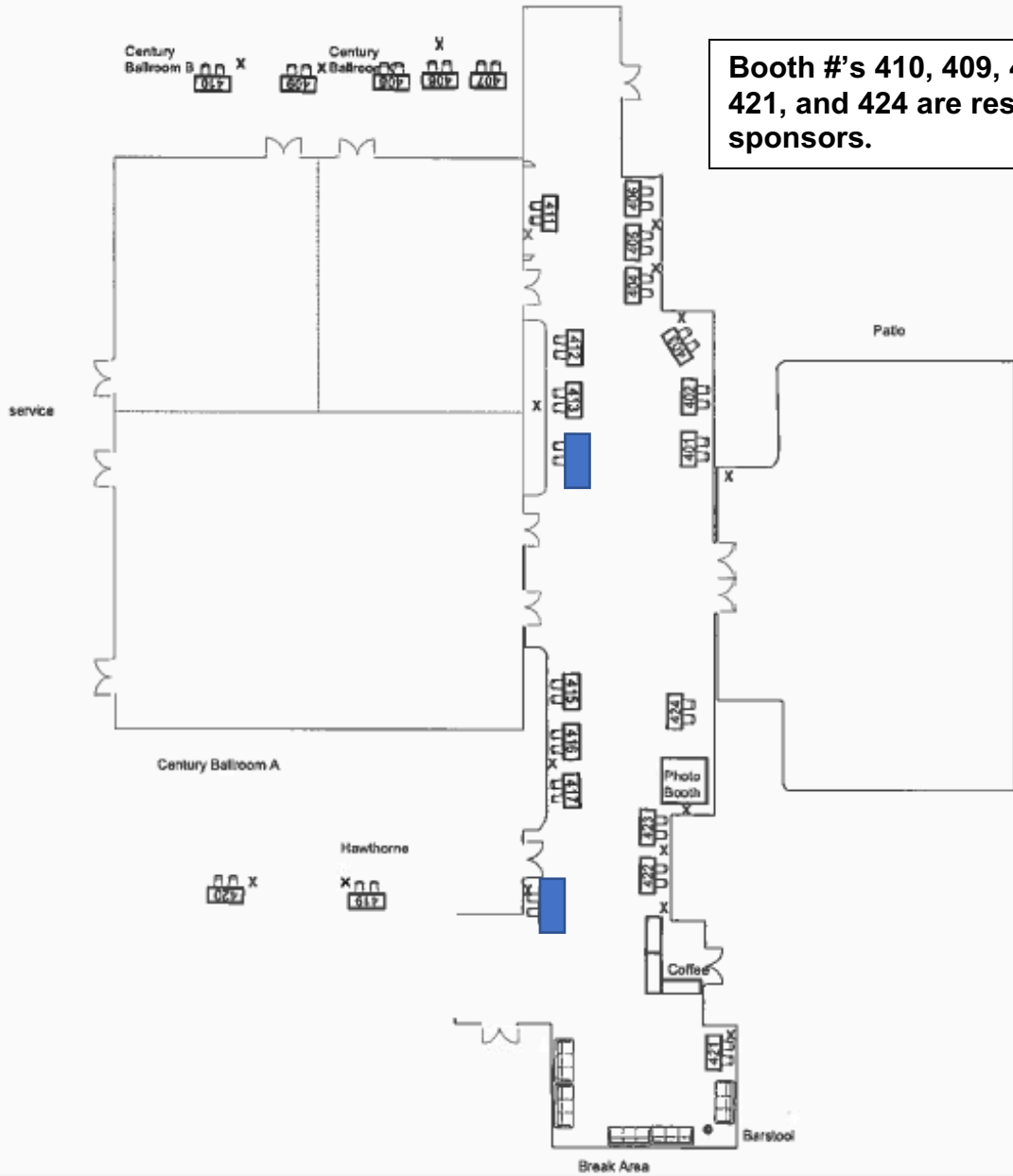
Century Ballroom, Prefunction, Patio and Break Area

FRIDAY, JULY 26, 2019 | OF HILTON, GAINESVILLE