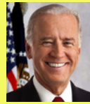
Joe Biden (D)