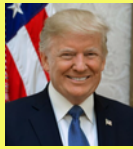
Donald Trump (R) Incumbent