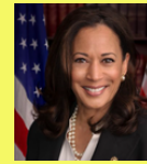
Kamala Harris (D)