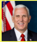
Mike Pence (R) Incumbent